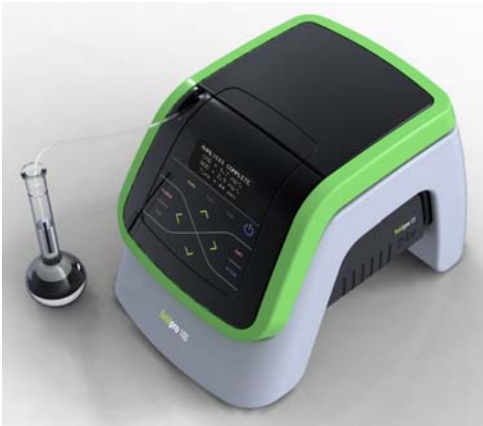
Bronze Award: Aqua Diagnostic's PeCOD L100 Analyzer