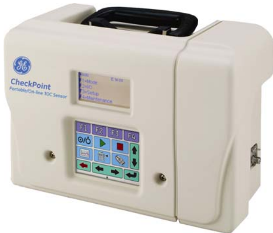
Gold Award: GE's Checkpoint TOC Analyzer